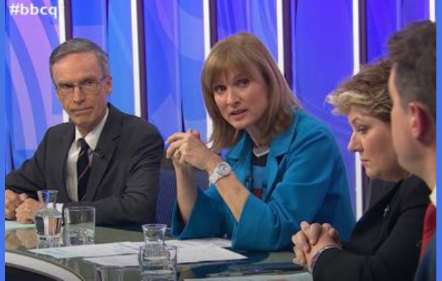
Talking politics on BBC Question Time