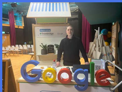
Welcoming Google to Trowbridge and sharing my TechTrowbridge vision with local entrepreneurs

'Tech and innovation are the foundations on which the future of our country is being built. I want our county town and its environs to have a slice of the action just as they did during the Industrial Revolution.'