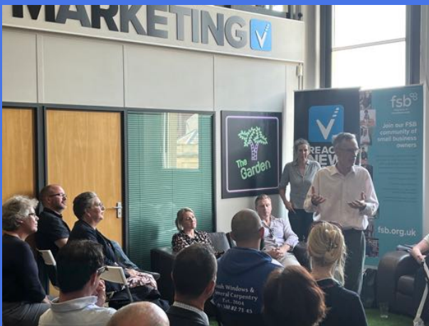
Talking TechTrowbridge with local entrepreneurs at Access to Finance. Huge thanks to the Federation of Small Bussinesses and the University of the West of England for organising and Elevate Online Marketing for hosting.