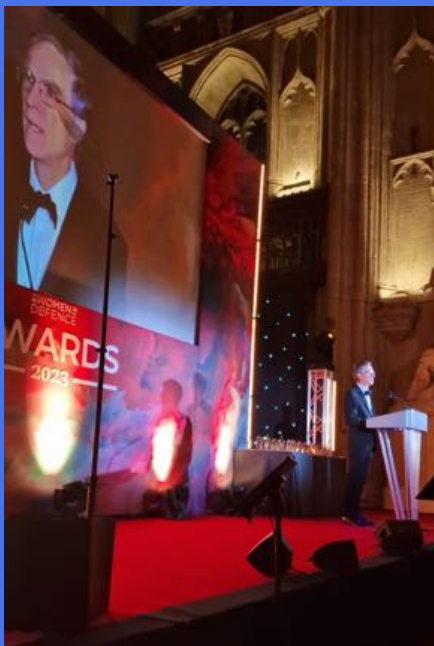
Speaking at the Women in Defence Awards