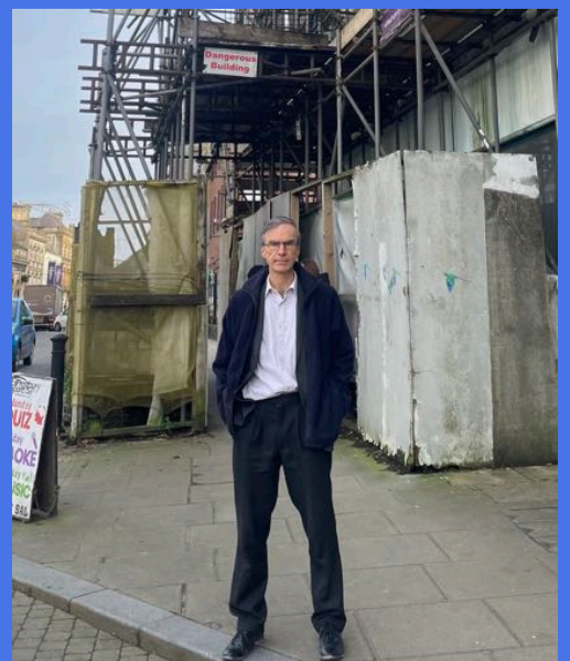
Right: Warminster - nice high street minus the mess in the middle. Residents and businesses shouldn't be entering yet another year with No. 3 blotting our townscape. Enough!