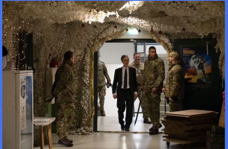
Another ministerial visit to British forces in Estonia