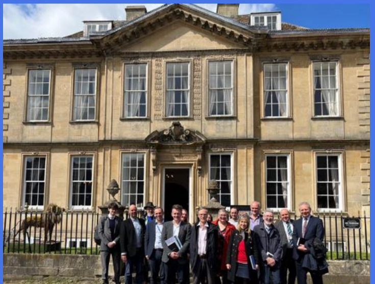
Outside Parade House after a Trowbridge Place Partnership meeting