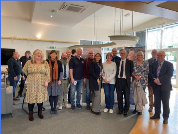
With veterans and staff at Alabaré in Salisbury discussing work to transform the lives of ex-service people