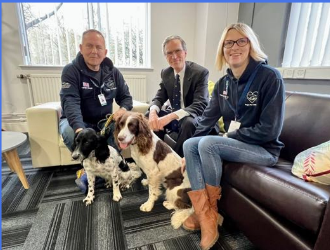
Therapy dogs. Meeting some four-legged friends from Dogs for Health at my Trowbridge office.