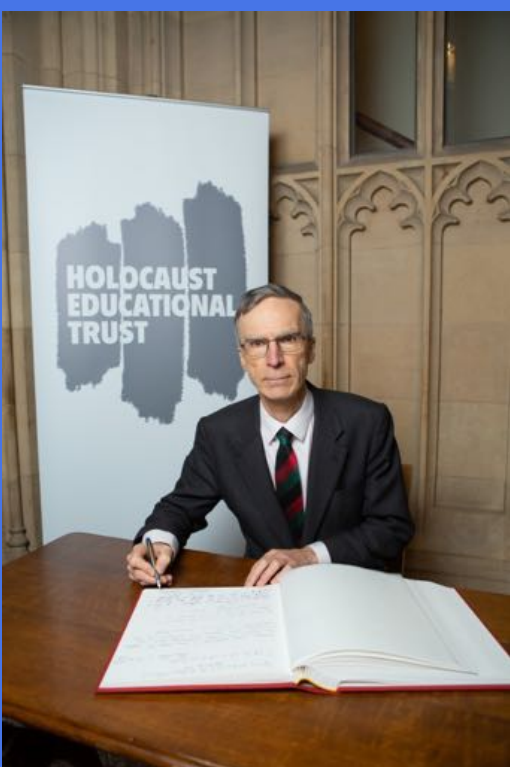
Signing the Holocaust Educational Trust's Book of Commitment