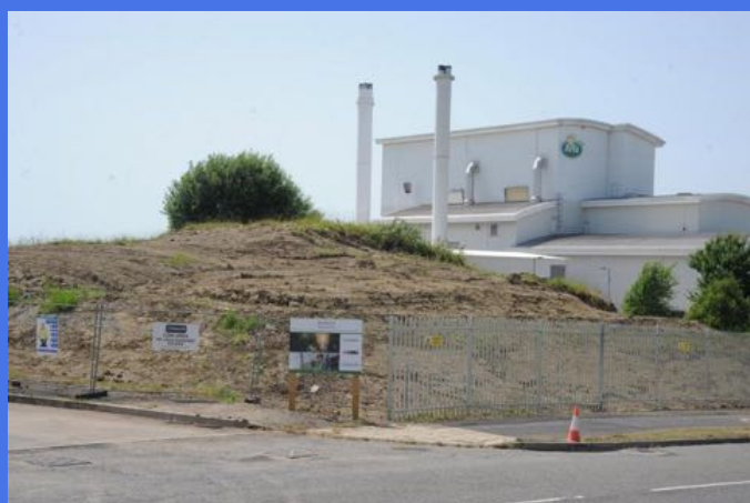
Northacre Industrial Park, the planned site of the £200 million Westbury incinerator. I immediately condemned the inspectorate's decision as 'horrifying'.