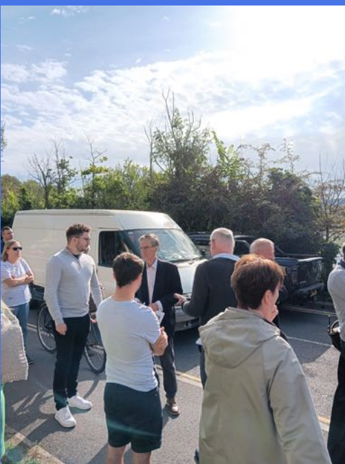
Site visit with residents at Slag Lane