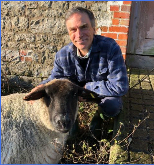
One of my woolly friends, Back British Farming Day