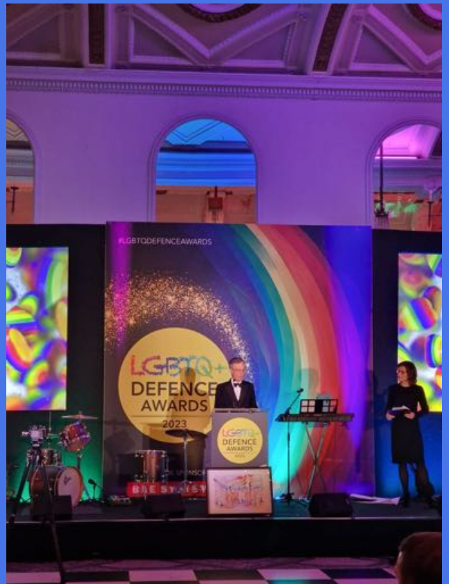
Speaking at the LGBTQ+ Defence Awards, celebrating courage in a year of change