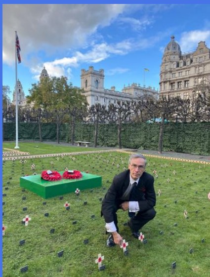
Left: Planting my Royal British Legion poppy at the Garden of Remembrance at the House of Commons