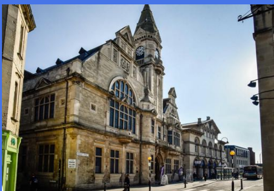
A key item on the Trowbridge Place Partnership agenda was how the Future High Street Fund award of over £16 million was being spent. In particular, we discussed the money going to the regeneration of the old town hall and the filling of vacant units

'Tech and innovation are the foundations on which the future of our country is being built. I want our county town and its environs to have a slice of the action just as they did during the Industrial Revolution.'