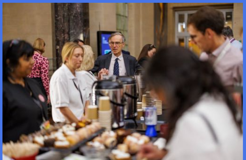
Sharing a cuppa with volunteers at the SSAFA Big Brew Up