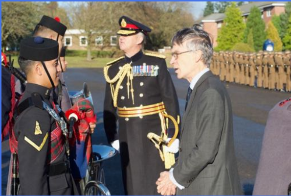
Inspecting Gurkhas passing out parade in Yorkshire