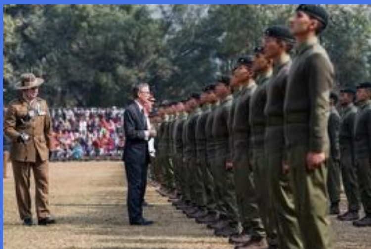
Inspecting Gurkha soldiers in Nepal