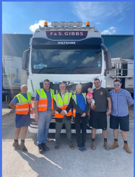
Visiting F&S Gibbs Transport Services Ltd to see the site their award money will be spent on