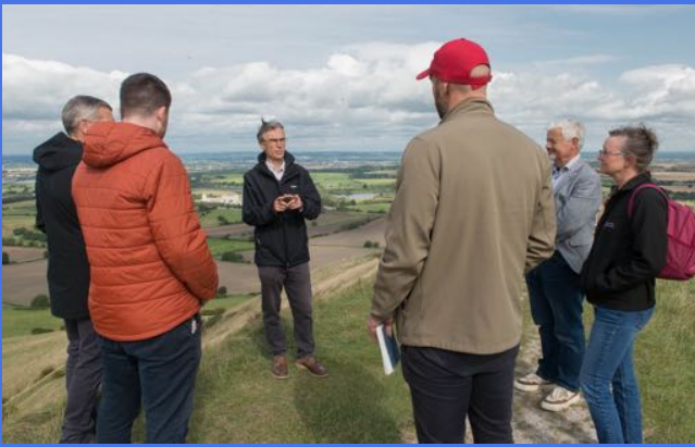
Joining England Heritage at Bratton Camp to see the result of the landmark's much-needed restoration

The horse was likely carved to commemorate the defining 878 Battle of Ethandun in nearby Edington. This is the one in which Alfred defeated the Danes. Thus my constituency can properly be said to have witnessed the dawn of what we know as England. A proud boast.