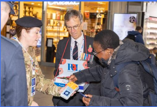
Selling poppies at King's Cross, raising money for the Royal British Legion