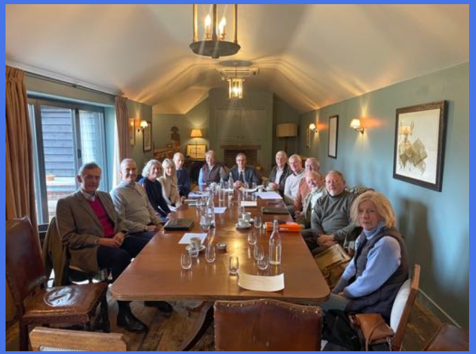
'Weight watchers' for HGVs in Maiden Bradley, Corsley, Chapmanslade and the Deverills