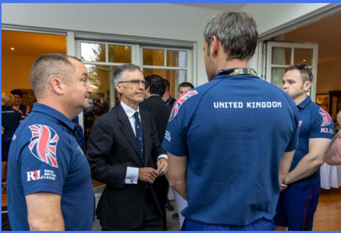
Talking to Team UK at the Invictus Games